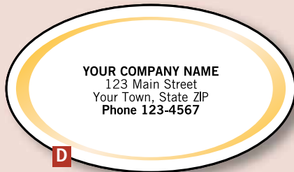
Imprint: Up to four lines