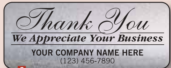
Imprint: Up to two lines