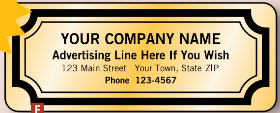
Imprint: Up to five lines