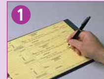
Write the check.