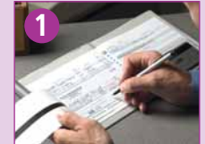
Write the check.

When you write the check, details automatically transfer to the ledger and the journal at the same time. Write it only once.