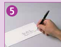
Copy the name and address onto the envelope.