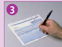
Copy the information onto the invoice.