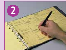
Copy the information onto the stub.