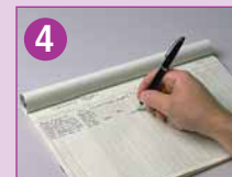
Copy the information again onto the check register.