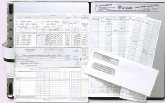
APD-35 Payroll/Disbursement System

Ideal system for small businesses that use a single bank account for both payroll and accounts payable. Switch from general disbursements to payroll by simply inserting a payroll earnings record card. This system offers a better way to pay employees and vendors.